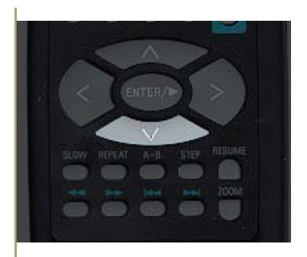
Press DOWN until PREFERENCES is highlighted.