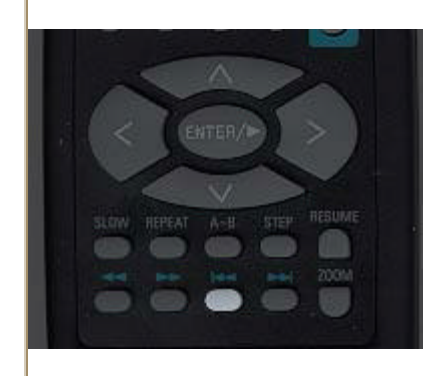
Press track BACK.