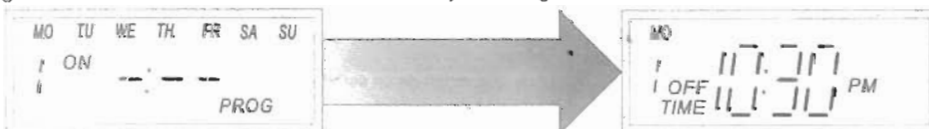
FIG 6: Setting the timer to turn off at 10:30 PM each Monday for Program 1